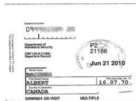
Example of an I-94 Departure Record

The costs of a P2 extension are the same as the costs of a new P2.