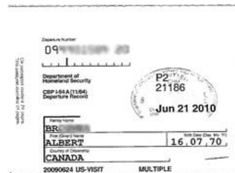
Example of an I-94 Departure Record

The costs of a P2 extension are the same as the costs of a new P2.